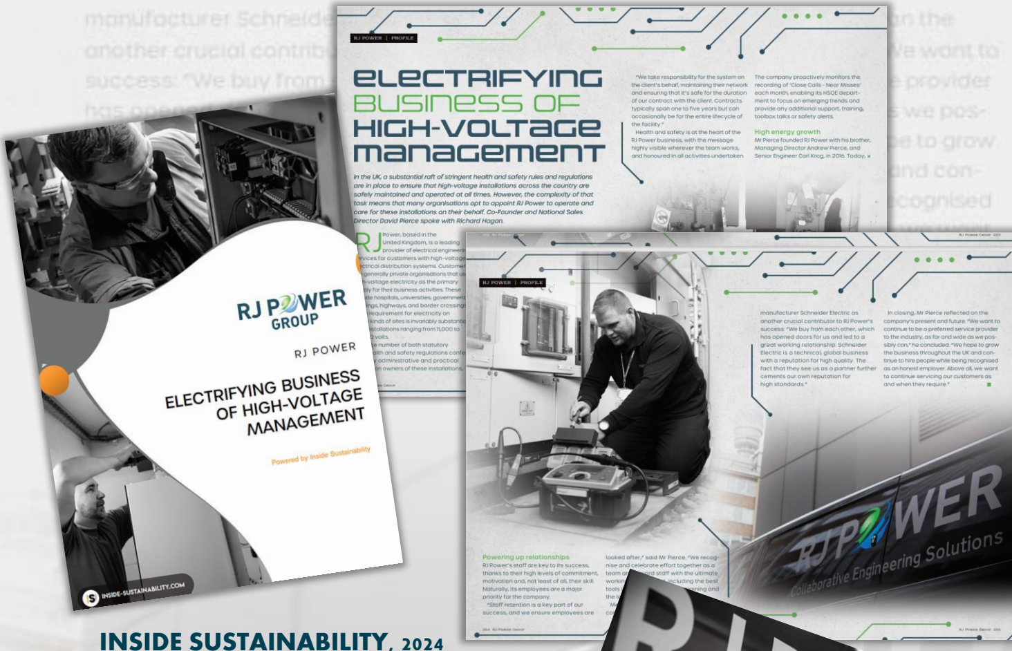
INSIDE SUSTAINABILITY, 2024